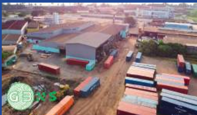
Basso Legnami production facilities in Gabon

Basso Legnami especially has a long history of direct presence on African soil, where it has production and marketing exclusives.