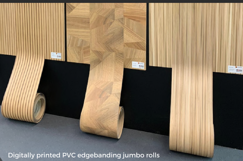
Digitally printed PVC edgebanding jumbo rolls