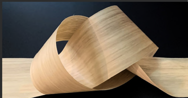
Extra-flexible wood veneer

Also, our Décor Programme collection is conceived to add value to furniture and interiors, since the edgeband takes center stage and becomes a decorative element.